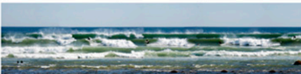
09.01.08 Trailerpark1 no.137