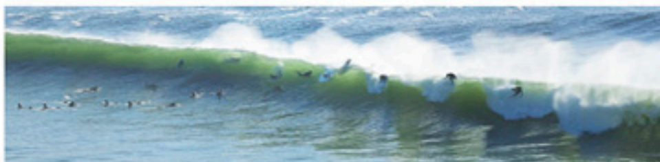
10.26.08 Camp Hero no.133.