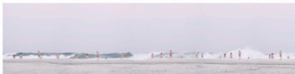
07.01.08 Cameron Cut@15