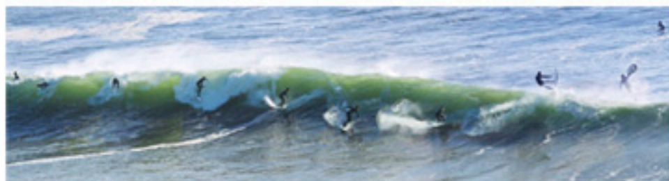
10.26.08 Camp Hero 2 no.1351AC