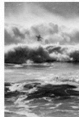
09.07.08_radar beach no.136.