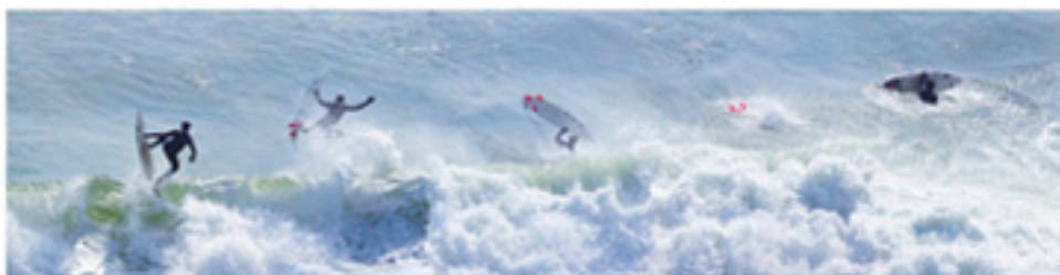
03.27.09 Camp Hero no.5